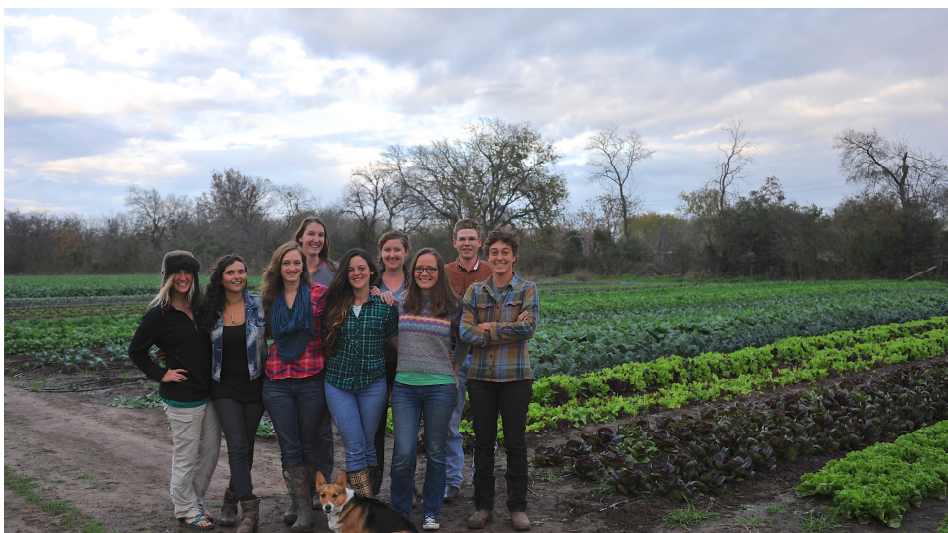
2014 Farmerstarter students and staff.

Farmshare Austin is a 501c3 that is accelerating organic farming knowledge to scale organic food access in Central Texas by offering on farm education and training to aspiring farmers, facilitating research for organic and sustainable farming practices, preserving land and natural resources needed for farming, and facilitating innovative giving programs that put organic food on the tables of those who are most food insecure in our community.